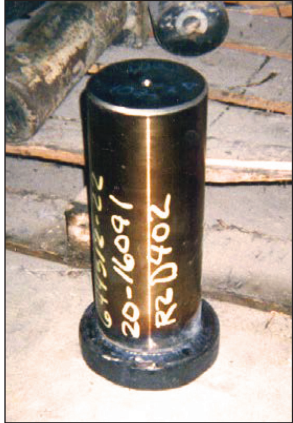
Astralloy-V® Overlay (AVO) pin after 240 days of service. Wear rates were measured and results showed a maximum of 0.060" of wear. The pin was put back in service and is still running today with minimal signs of wear.